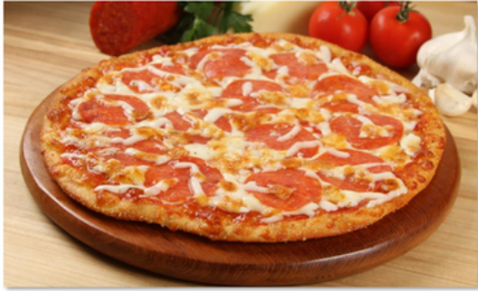
Thin Crust "Artisan" Style Personal Pizzas